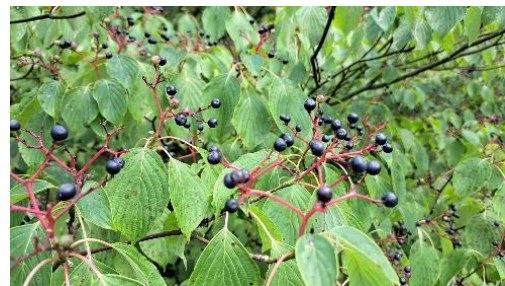
Alternate leaf dogwood, Photo by Gary Cowell. The bush/tree is a nice native shrub, very attractive to hungry birds. In this case, Gary saw catbirds, brown thrashers, red-eyed vireos, and Eastern kingbirds "gorging" on the berries.