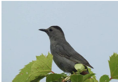
Gray Catbird.