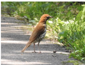
Apologies! Last month I mislabeled my favorite songster. It is a wood thrush.